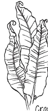
HART'S TONGUE Green, ripe July-Aug'