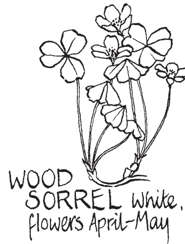
WOOD SORREL White, flowers April-May