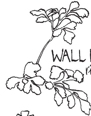
WALL RUE Green, ripe June-Oct'