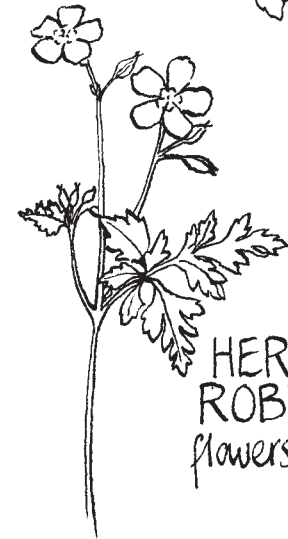
HERB ROBERT Pink, flowers May-Sept'